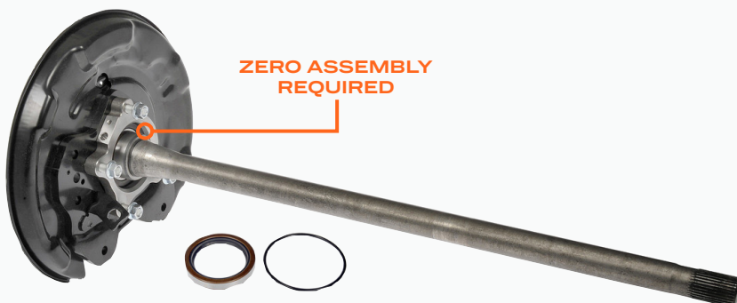
926-143 (Rear Left) | 926-144 (Rear Right) Toyota Tundra 2016-07 - V8 4.6L

TIME-SAVING SOLUTIONS | NOW 12 PARTS AVAILABLE