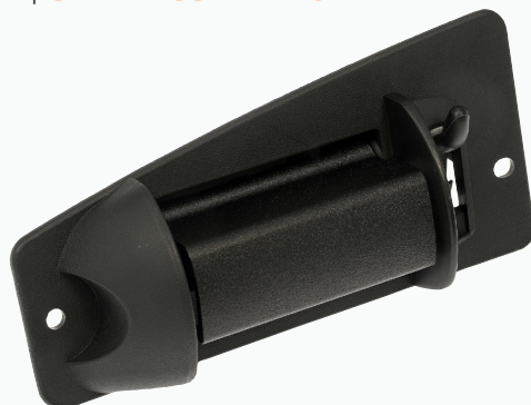
79100M (Rear Left) Chevrolet 2007-00, GMC 2007-00

UPGRADED SOLUTION | SEAMLESS REPLACEMENT